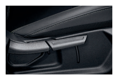
Driver seat height adjuster