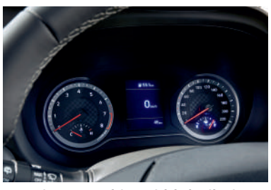
Speedometer with multi-info display