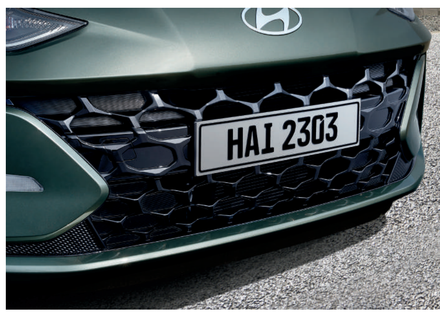
Black radiator grille