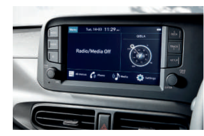
8" Touchscreen HD display