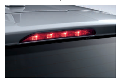
LED high-mounted stop lamp