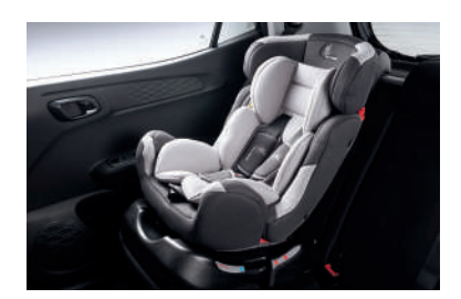
ISOFIX child seat anchor system