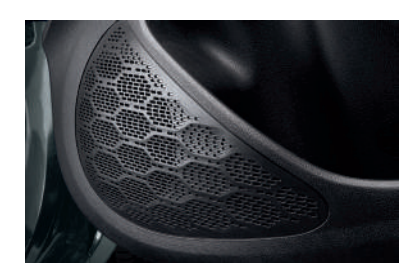
Front / Rear four-speaker system