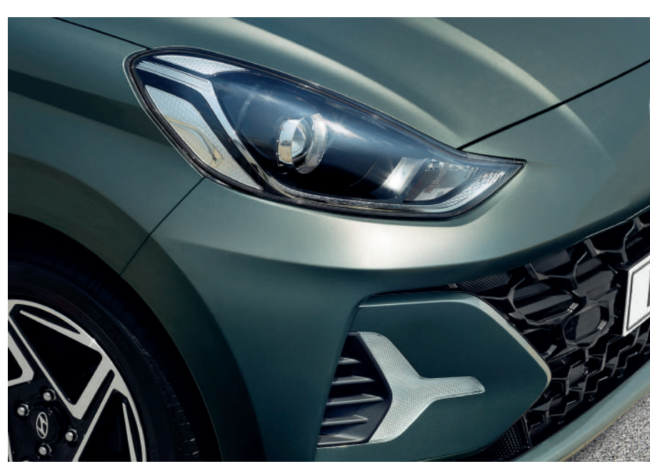
Projection headlamps / LED Daytime Running Lights (DRL)