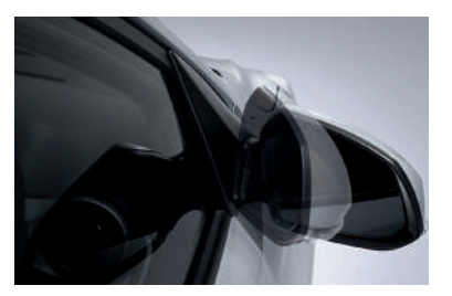
Electric folding mirrors