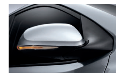
Outside mirrors & repeaters