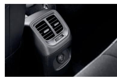
Rear AC vents