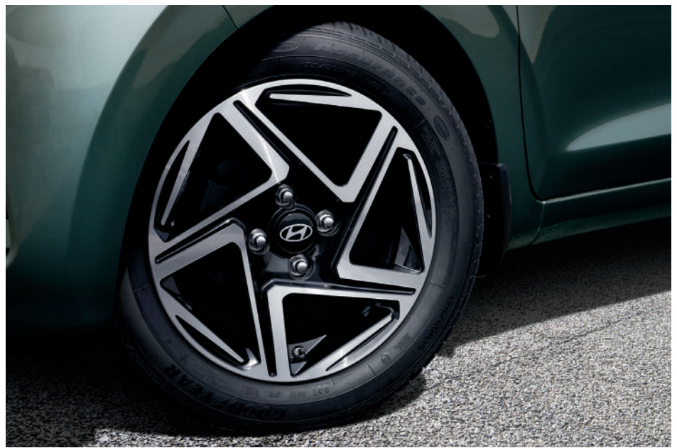
15" alloy wheels