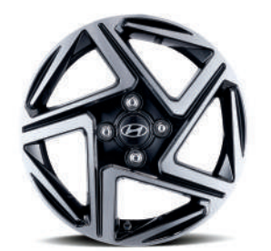
15" Alloy wheel