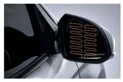
Heated side mirrors