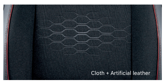
Black mono-toneRed pack)