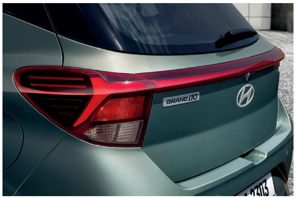
LED tail lamps