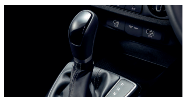
4-speed automatic transmission For drivers who demand maximum convenience, Hyundai offers the optional 4-speed automatic: It's reliable, quiet and efficient.