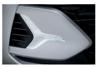
LED Daytime Running Lights (DRL)