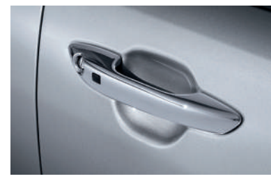
Chrome-coated door handles