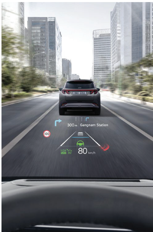
12-inch Head-up Display (HUD)*