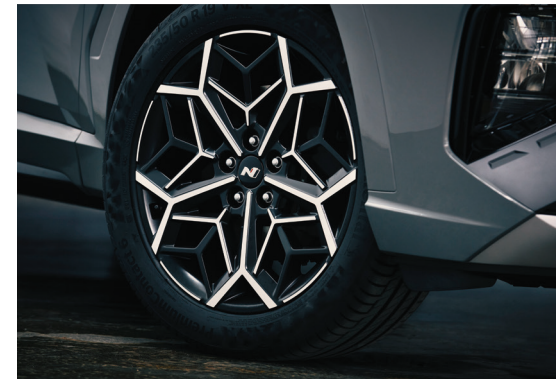
Roof Rail / Panoramic Sunroof 19-inch Alloy Wheels*