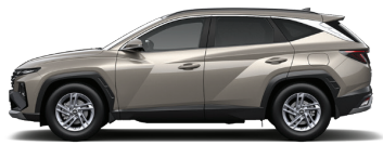
Cashmere Bronze - Metallic*