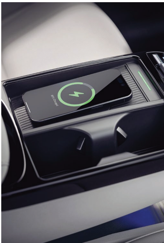
Wireless Power Charger (WPC)*

A reinvented layout with a host of intuitive technologies that enable an effortless and convenient on-the-road experience.