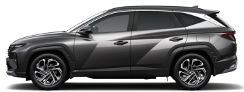
Ecotronic Gray - Pearl**