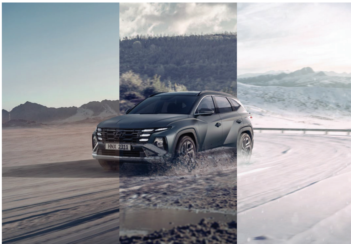
4WD HTRAC* / Terrain Mode (Sand, Mud, Snow)

TUCSON AWD provides optimal driving performance through actively distributing driving force to the front and rear wheels according to various driving situations.