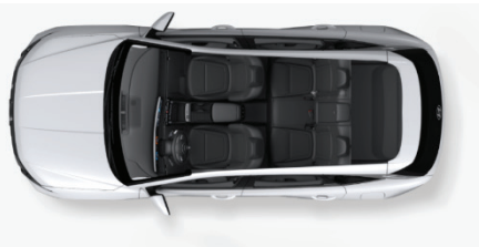
Black Mono-Tone Leather