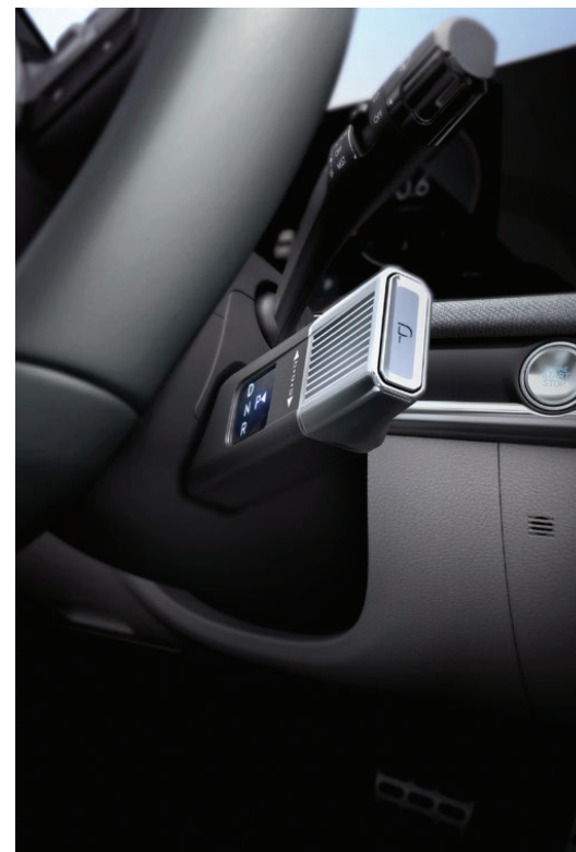
Column-type Shift by Wire (SBW)