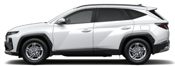
Creamy White - Pearl**