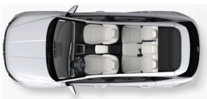
Moss Gray Two-Tone Leather