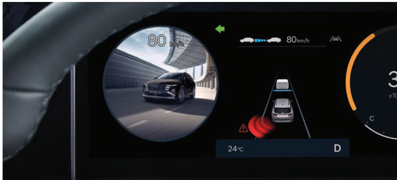
Blind-Spot View Monitor (BVM)* Surround View Monitor (SVM)*

The new TUCSON is packed with reliable features to protect you from the unexpected and ensure you leave no one behind.