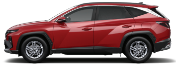
Ultimate Red - Metallic**