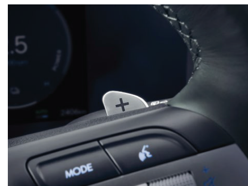
Hybrid Exclusive Features

Paddle Shifter-Regenerative Braking Mode