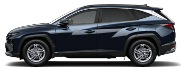
Ocean Indigo - Pearl*