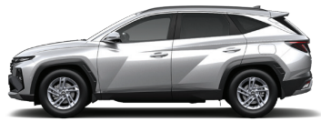
Shimmering Silver - Metallic*