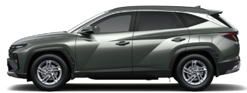
Amazon Gray - Metallic*