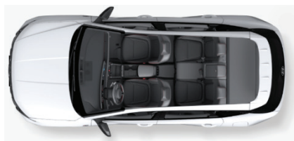
Black Suede Leather*