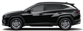
Phantom Black - Pearl**