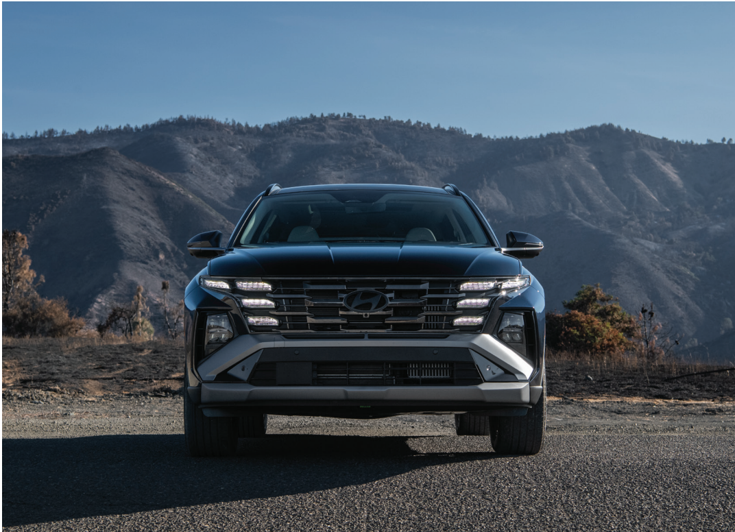
Parametric Jewel Hidden Signature Lamps / Radiator Grille / Front Bumper

Behold the new TUCSON's evolved signature parametric jewel design. Here to showcase a more prominent and dynamic character than ever before.