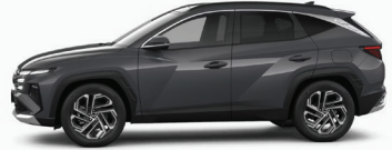
Ecotronic Gray - Matte*